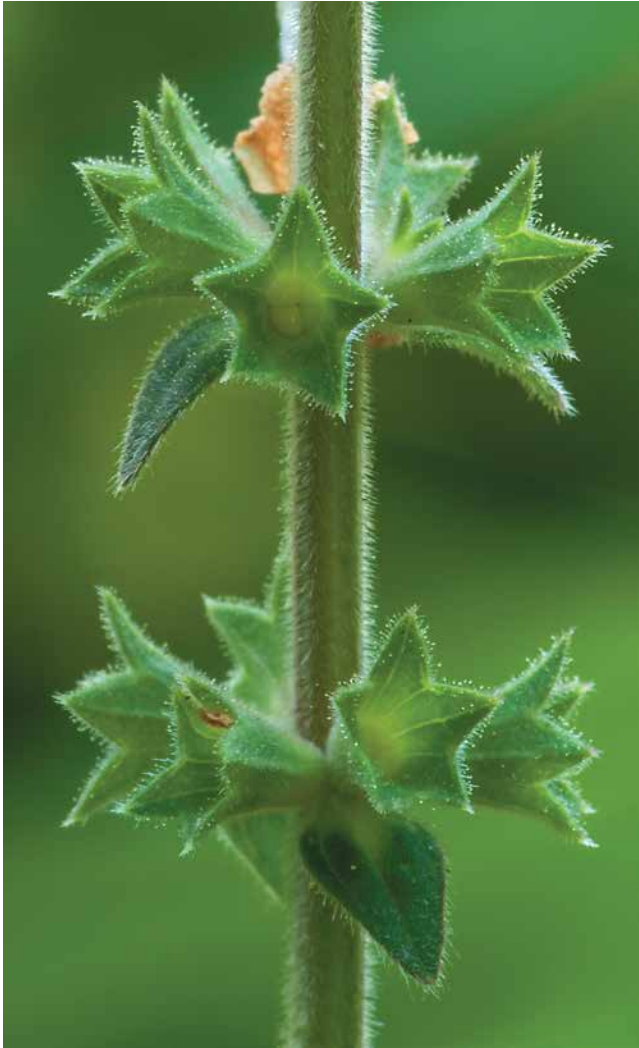
FIG. 3. Flowers in early fruit of Stachys caroliniana .

flatwoods and a freshwater marsh; this population has not been seen since its first collection. The same plant was collected again in 1990 in Georgetown County, in its only other known locality (the type locality), approximately 8 air miles (13 km) to the northeast of the first collection, this on the north side of the Santee River. This second site is 10.4 air miles (17 km) south of the city of Georgetown on the west-central part of Cat Island, within the Tom Yawkey Wildlife Center, also managed for wildlife by SCDNR, in Georgetown County (Nelson 2002). The site of the type collection is barely 0.4 miles (about 600 m) east of the Intracoastal Waterway. The Yawkey Center collection is in habitat similar to that of the Charleston County population, along the south side of the Santee River. [The watershed of the Santee River effectively drains nearly half of South Carolina: a common misconception is that the Savannah River is the major river system of South Carolina, when in fact its watershed is much more important—biologically and culturally—in neighboring Georgia (Edgar 1998)].