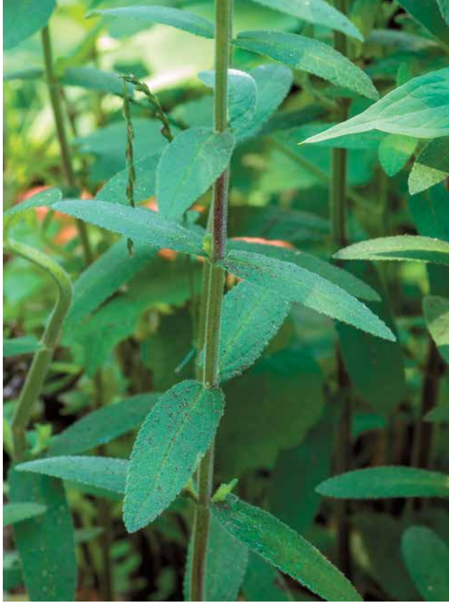
FIG. 4. Midstem leaves and stem of Stachys caroliniana.

known to occur in Charleston and Georgetown counties are the two relatively uncommon natives S. aspera and S. tenuifolia , as well as the widespread and weedy S. floridana . These three sympatric taxa, as well as others, are discussed below.