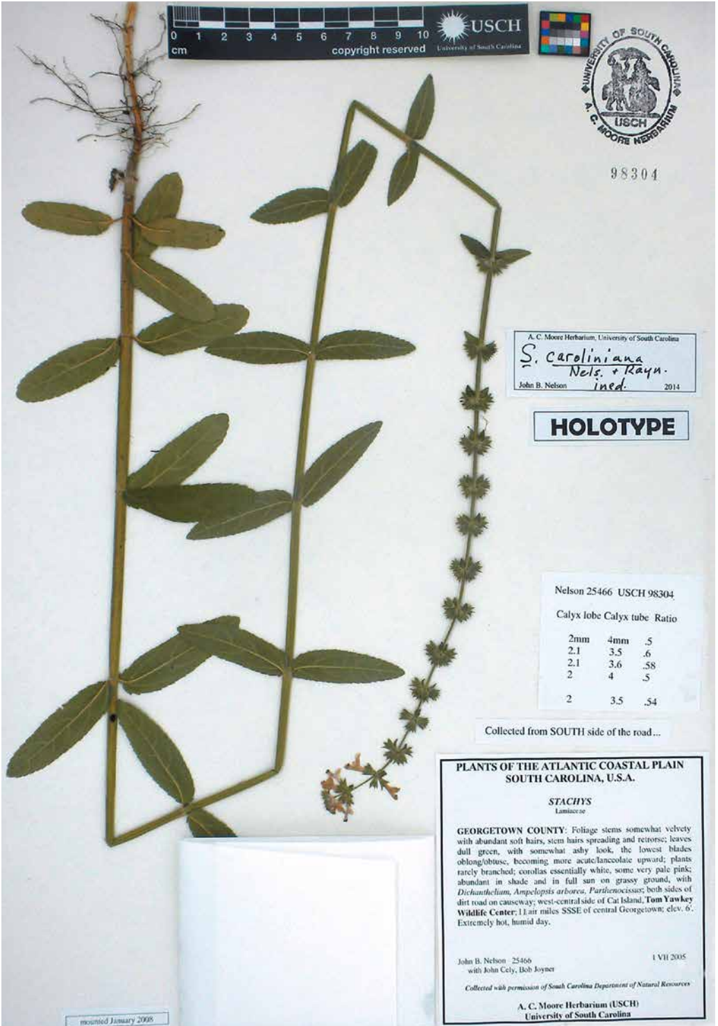
Fig. 7. Holotype of Stachys caroliniana (Nelson 25466).