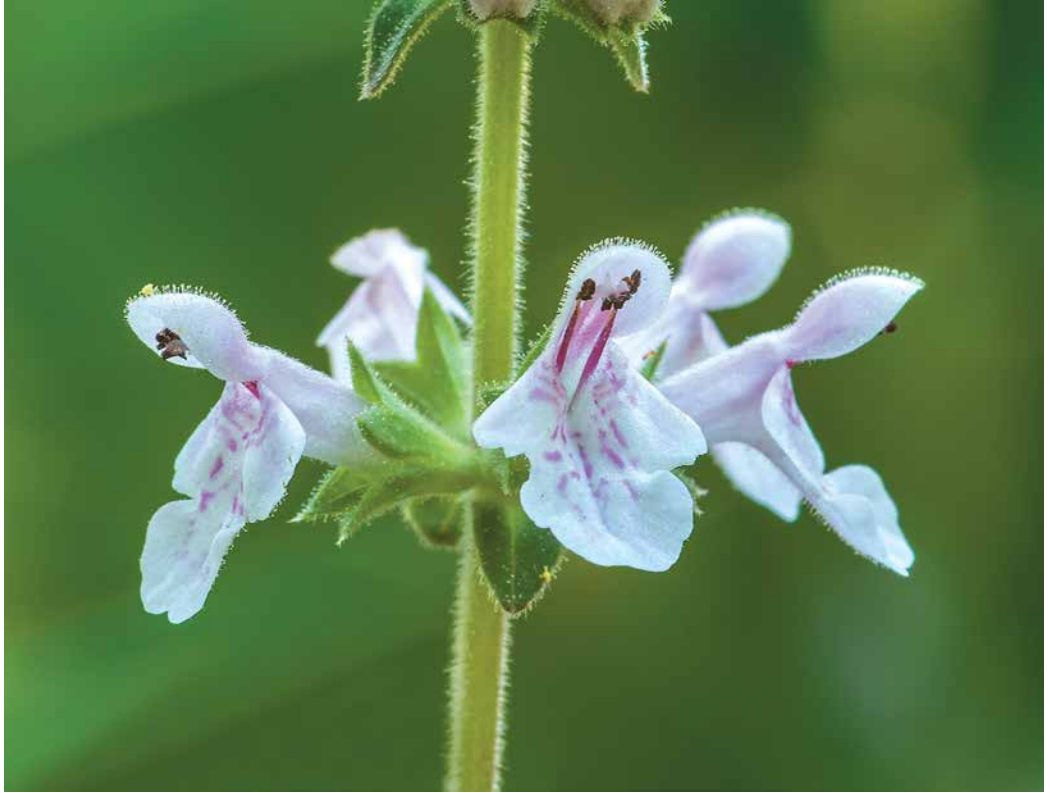
FIG. 2. Open flowers at a single node of Stachys caroliniana .

6-flowered; bracteoles narrow, spinulose, glandular and pubescent, 0.5–0.8 mm long; flowers perfect and fertile; calyx campanulate, densely short-soft pubescent, with abundant delicate, stipitate glands; fruiting calyx 5.5–7 mm long, the tube (to base of lobe sinus) 3.5–4 mm, the lobes 2–3 mm; lobes abundantly hairy with eglandular and stipitate glands, especially along veins, deltoid to lanceolate, mostly \frac{1}{2} the length of the tubes, each lobe terminated by a pale apiculum; corolla tubular and galeate, from base to galea apex 13 mm long at full anthesis; corolla tube prominently saccate toward base on lower side, internally glabrous, but with prominently slanting (oblique) annulus, copiously pubescent with soft, bulbous trichomes; corollas white, scarcely pinkish, save for scattered spots on lower lip, the lower corolla lip declined up to 90° from tube, to 7 mm long, the central lobe nearly rotund, 4–5.5(–6) mm broad; filaments pink, with short, capitate glands as well as bulbous trichomes; mericarps 1–1.2 mm broad, 1.6–1.8 mm long, dark brown, minutely pebbled.