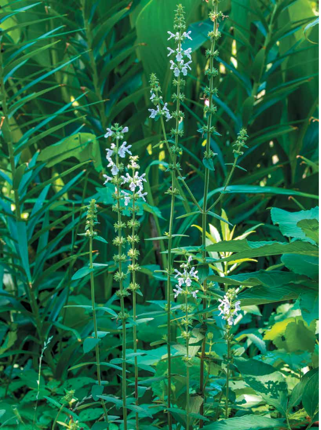
Fig. 1. Flowering stems of Stachys caroliniana .