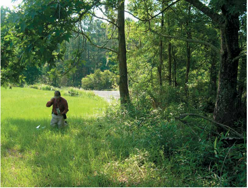
FIG. 5. Habitat at type locality of Stachys caroliniana , John Cely pictured.

and West Virginia and is known additionally from a number of upland, “interior” sites. This is a variable taxon, most often with glabrous/glabrate stems, these not infrequently slightly retrorse-hispidulous. This taxon always features prominently petioled leaves with blades which are lanceolate or elliptical, and usually with strongly serrated margins, with the plants commonly branching well below the first fertile node. Its corollas are distinctly pink. Calyx lobes of S. tenuifolia , in fruit, are commonly curled backward. Stachys tenuifolia has also been regarded as a near relative of S. hispida , the two taxa sometimes intergrading (Cooperrider & Sabo 1969).